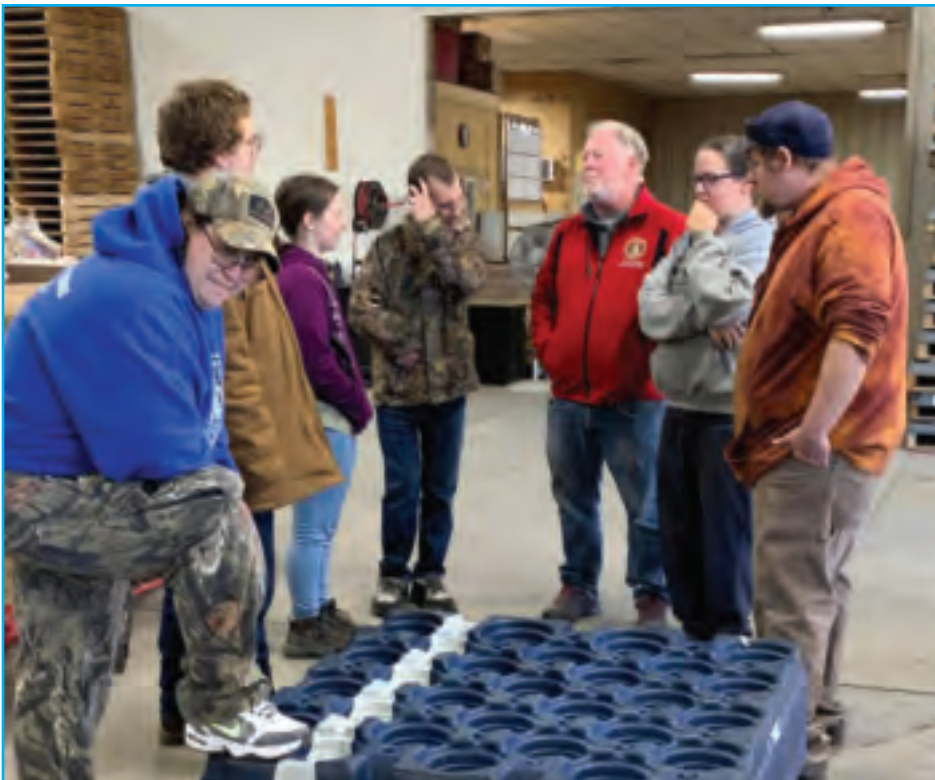
Workshop services include contracts with individual businesses which include everything from small local firms to national corporations.

It’s a formula that is a proven winner for Missouri and Missourians.